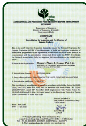
5. Organic certification (under NPOP Standards) (By NOCA. A certifying agency approved by APEDA, Government of INDIA.)