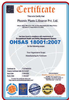
4. ISO 18001:2007 Occupational health and safety management system