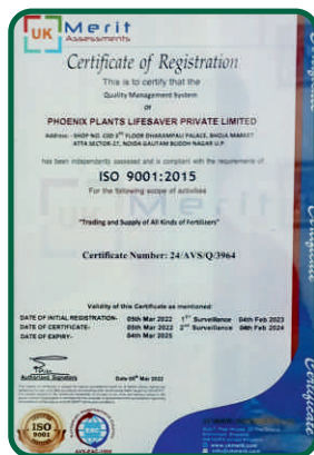
1. ISO 9001:2015 (Quality Management System)

We have received prestigious accreditations with respect to our quality assurance, plants manufacturing practices, environments safety management. We do ensure our company adherence towards all norms and compliance.