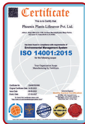
2. ISO 14001:2015 (Environment Management System)