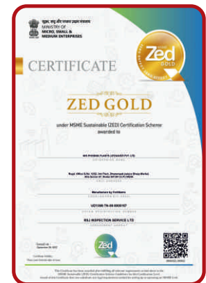
6. ZED Certified Zero Defect Zero Effect